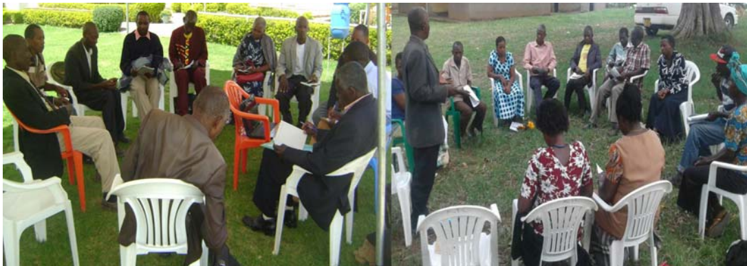
TIST farmers during their weekly meetings