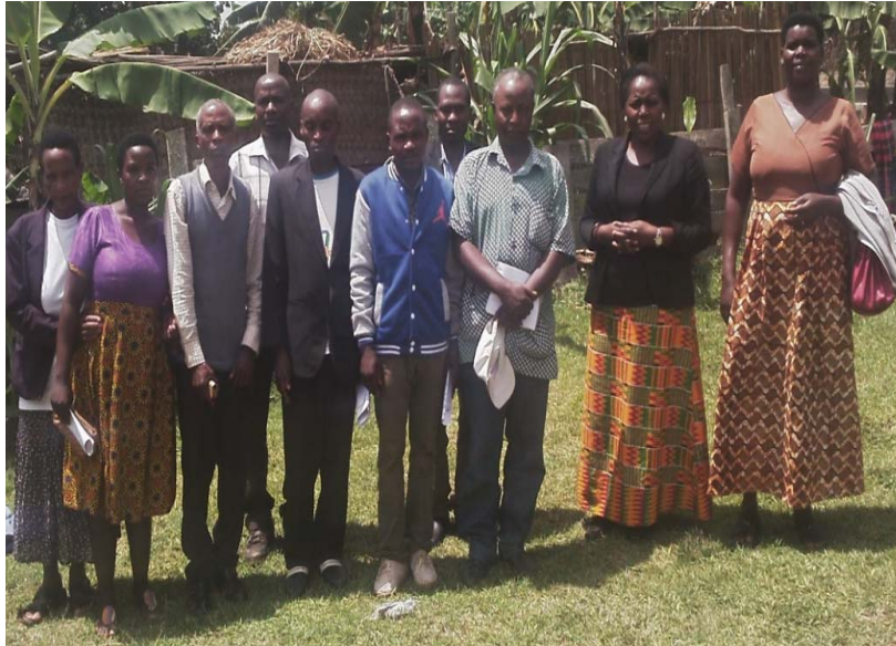
Bushenyi Volunteer trainers after meeting in Bushenyi