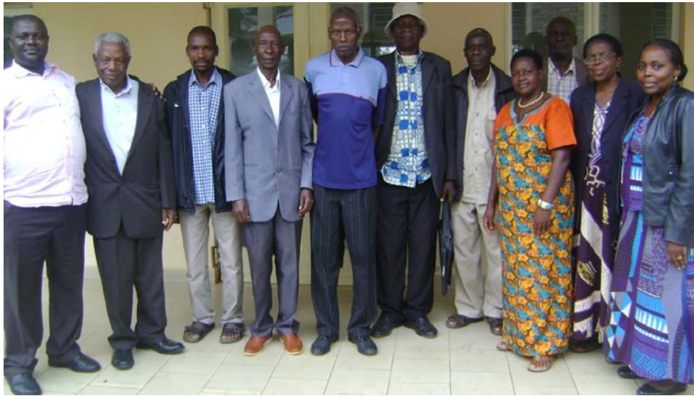
Bushenyi TIST Farmers who attended meeting for public comment