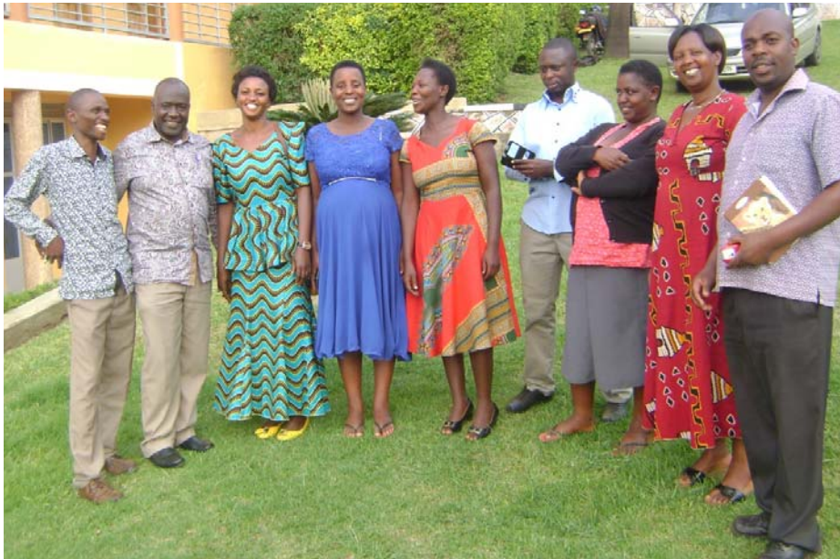
Green Team members after meeting in Rukungiri