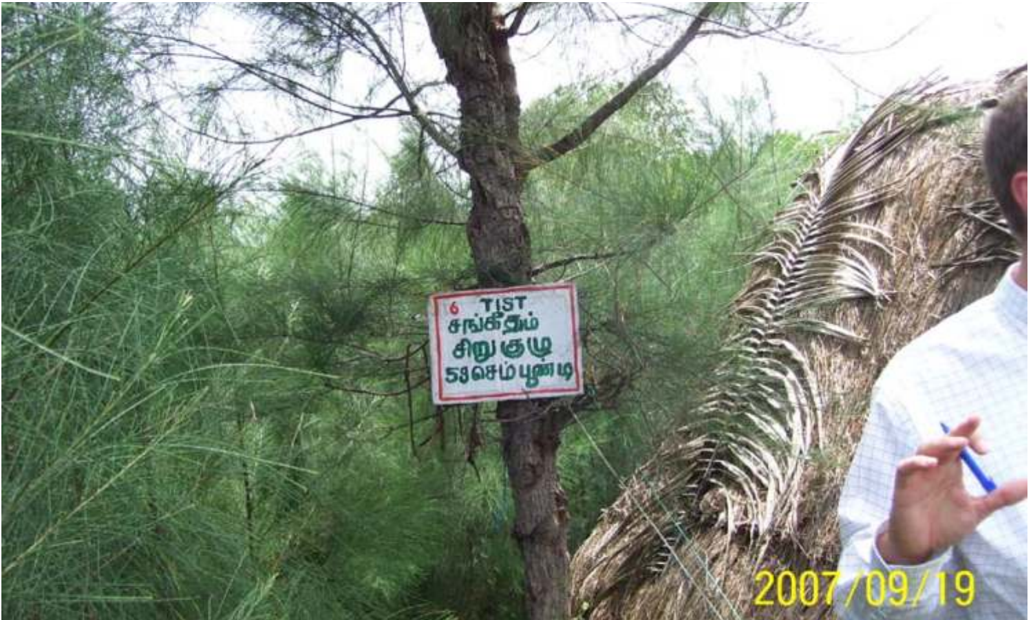
Name Plate: Sangeetham Small Group of Semboondy / NgaH gyi f: nrkG+z b i kaj j pd; r qfij k; rPWFO

Nj hgGfS f:F xU ngaH gyi f i tggJ kpFTk; Kffpakhdj hFk; rpy rPWFOffNs ngaH gyi f i tj;JssdH. mej ngaH gyi fahdJ> mej FOTpd; ngaH> FOi kak; kwWk; Nj hggpd; ngaH ci laj hf , Uff Ntz ;Lk; 'nfhyyNkL" vd cqfs; Nj hgGf:F Kj y; fz fnfLggpd NghJ ngahpl ggl ;L , UffpwJ vdwhy; gpwF xtntH fz fnfLggpd;NghJ k;'nfhyyNkL" vdw ngahpNy jhd; fz fnfLff Ntz ;Lk; rpy cWggpdHfs; j qfsJ Nj hggpd; ngai u kweJ tPLfwhHfs; fz fnfLgghSH vyyhj; Nj hgGfi sAk; ngauhy; epi dtpy; i tj;Jf; nfhs;tJ rhj j pakhdj yy. Nji tahd mi dj;J tguqfs; ml qfpa ngaH gyi fi a mej Nj hgGfS f:F i tjj Ny eyy nray;Ki wahFk; mLjj fz fnfLgG RwwpyUeJ cqfs; fz fnfLgghsh> cqfs; Nj hgGfs;py; ngaH gyi f , yi yahdhy; fz fnfLffkhl ;l hH. mJTk; cqfs; tTr;rH gz toqfi yAk; ghj pf;Fk; xtntH Nj hgGf:Fk; cl dbahf ngaHgyi fi tff mi dj;J rPWFOffi sAk;b] !; Ntz ;LfpwJ.