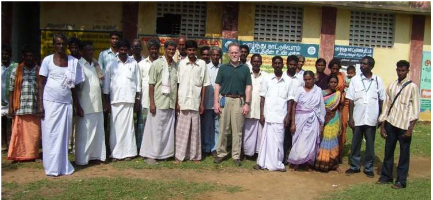
Members at T.B.Puram / j pkK+ghyGuj j py; (g;Ns ] ghi sak; i kak) cWggpd Hfs;