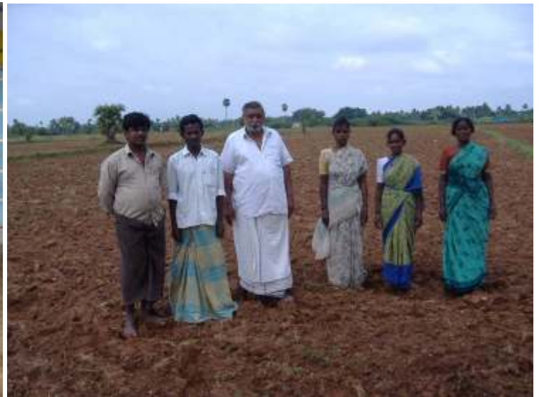
Members at Thurinapuram / J UQ;[ hGuk; i kaj j py; cWggpd Hfs;