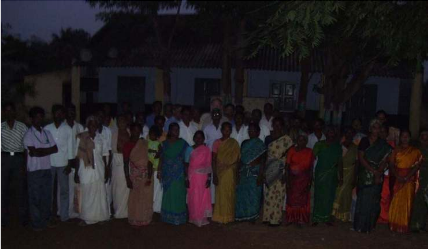
Members at Mel Kodungalur / Nky; nfhLq;fhY}H i kaj j py; cWggpdHfs;

Fz fnfLgG vdgJ b] !; jplljy; css gy nrayghLfsy; Kffpakhd xdwHk; kuqfi s vz Z tjhy; kuqfshy; NrkjJ i tffggLss fhHgd;msi t fz ffpL KbAk; cqfs;rpWFO khj mwppi fi a eb;fs; epugGk; NghJ > kuqfs; gwwpa thpi rapy; fz fnfLg;ghshpd; efypd;gb mwppi fi a epuggf;$lhJ. khjjjwnfhU Ki w cqfs; kuqfi s eb;fs; vz z p vjji d kuqfs; capUl d;cssd> cqfS fF vdw tgujij mej rpWFO khj mwppi fapy; vOjggL Ntz ;Lk; fz fnfLggpd; NghJ > Fi wej J mej rpWFOtpd; , U cWggpdHfs; fz fnfLggHsNuhL cl d; nrdW mej fz fnfLggHsUfF fz fnfLggpy; cjt p nraa Ntz ;Lk; fz fnfLggpy; cqfS fF Vj htJ reNj fqfs; , Uej hy> mgNghNj mej reNj fqfi s rhpnra;J nfhz ;L mq;NfNa fz fnfLg;G mwppi fi a j twhJ ngw Ntz ;Lk; cqfsJ fz fnfLggHsH>cqfs;ez gHfs>cqfs;kuqfi s fz fnfLff $ Lj yhd nghWgi gg;ngww cqfs;rf cWggpdHfs; Mth. MfNt fz fnfLggpd; NghJ cjt p nra;J k; rpw;Wz ;bfs; nfhLj ;J k; Cf;fggLj J qfs;