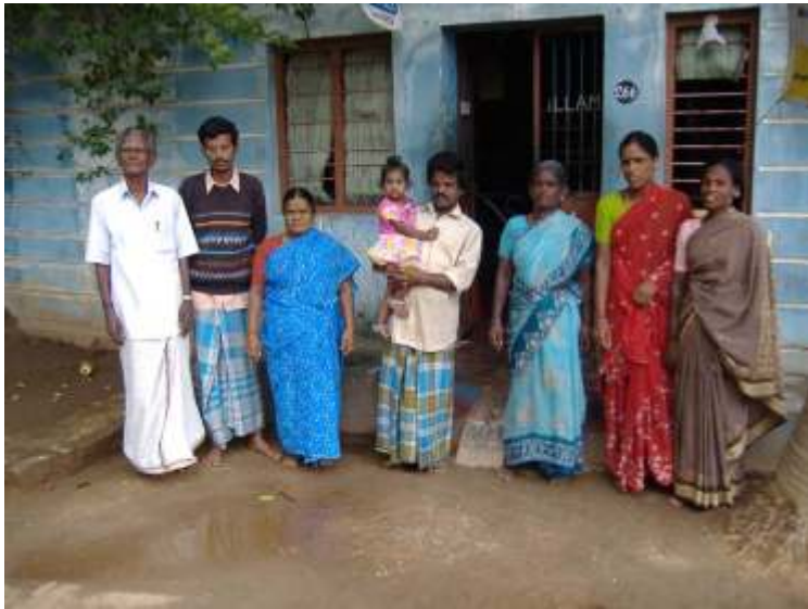
Members at Thurinapuram / J UQ;[ hGuk; i kaj j py; cWggpd Hfs;

The quantifiers have already made baseline quantification on 24 Small Groups and the four Small Groups who have planted trees are also quantified.