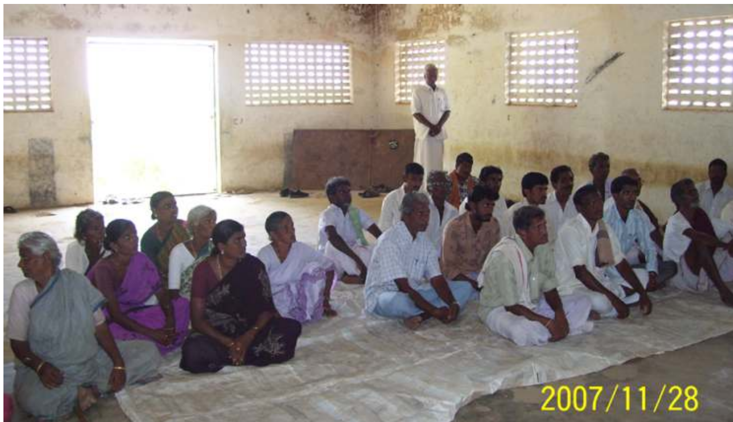
Members at T.B.Puram / j plkkG+ghyGuj j py; (gpNs] ghi sak; i kak) cWggpd Hfs;

vdJ mLj j tUi fapd;NghJ cqfs;py; mj pfkhd Ngi ughHf;f ehd;tpi of;Nwd;