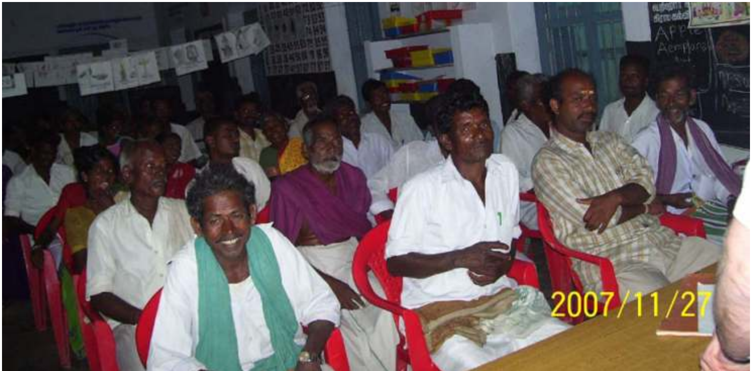
Members at Semboondy / nrkG+z b i kaj j py; cWggpd Hfs;

3. GpNs] :ghi sak; i kaj j py; rhHyp fþ;t Uk; rpWFO f;fs;pd; kuNj hgGfS fF tUi fj ej hH. m. n[ akkh rpWFO