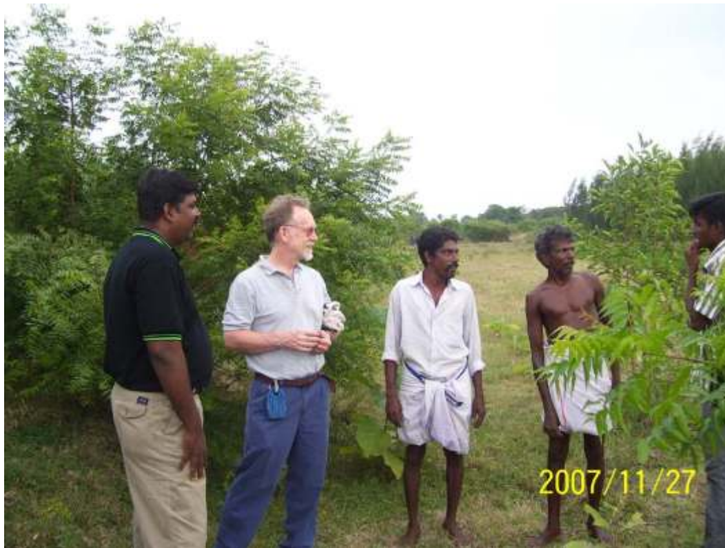
Grove of Sakthi Vinayagar Small Group / rfj p tpehafH; rpWFOff;spd; kuNj hgG